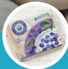
Stahlbush Island Farms Frzn. Blueberries 6.69/300g