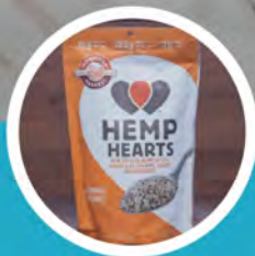
Manitoba Harvest Hemp Hearts 8.99/227g

Use left over banana and granola for garnish. It helps to make a smoothie feel more filling and satisfying.