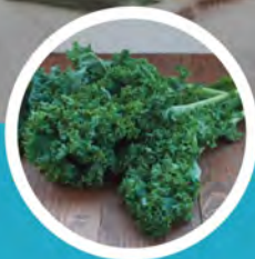
Reclaim Urban Farm Organic Kale- Mixed 5.99